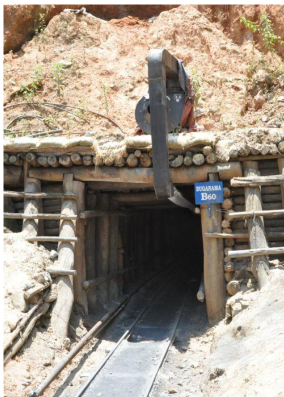
Figure 13: Safety ventilator