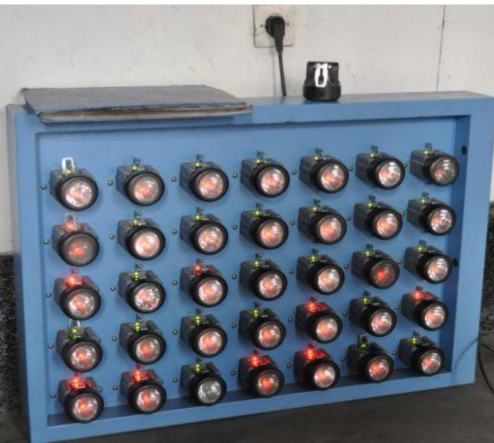
Figure 11: Investment into safety equipment