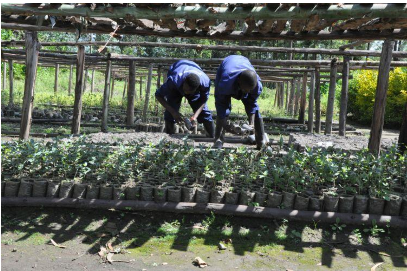
Figure 8: The plant nursery

Throughout the years, NBM has also been investing to improve social and environmental impacts, including by building relationships and engagement opportunities with stakeholders and communities around its operation. For example, NBM contributed to the local infrastructure, set up tree planting facilities, provided donations to education and health institutions and established childcare at the mine to support breast-feeding women with young babies. As a new and upcoming initiative, NBM is developing an Early Childcare facility, in cooperation with RMB, REWU and UNICEF. This has supported NBM's social license to operate and has helped demonstrate to communities and stakeholders that the professionalisation and mechanisation of the mine will benefit a broader set of stakeholders. It also illustrates how accounting for social and environmental impacts works hand in hand with other organisational changes. Further details on how the journey has affected the impact areas are shared in the dedicated section on the impacts' progress section below.