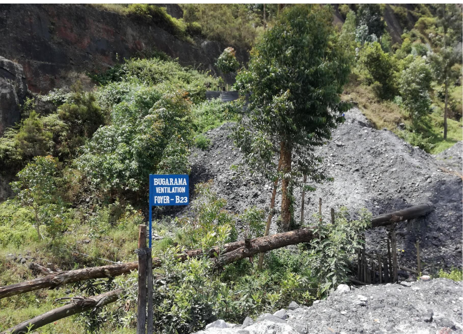
Figure 1: Ventilation sign

The case study is designed for a general, international audience to extract lessons learned from sourcing from artisanal and small-scale mining (ASM) in the Great Lakes Region, while supporting continuous and progressive improvement in terms of responsible sourcing requirements, formalisation and impacts management. The work supporting the development of the case study, has been co-funded by Fairphone, Specialty Metals Resources (SMR) - the major shareholder of NBM, and Wolfram Bergbau und Hütten AG (WBH), an Austrian Tungsten smelter which is the sole buyer of tungsten concentrates from NBM, making the supply chain a closed pipeline.