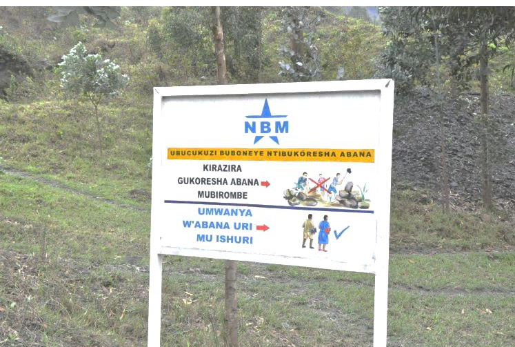
Figure 12: Awareness campaign on child labour