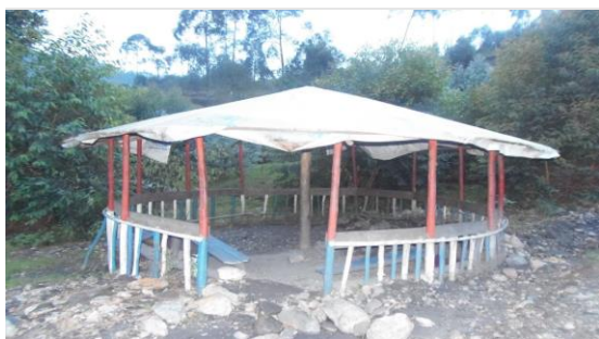
Figure 5: Office and meeting room: 2009-2012