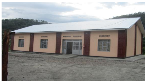
Figure 6: Office: 2016-today

Introduction of electricity. In 2020, NBM stopped using generators for electricity generation after obtaining connection to an electrical line. The energy is mainly generated from hydropower. Besides the advantages in terms of the reduced environmental impact associated with burning fossils fuels, the air pollution and noise derived from the generators, the introduction of electricity has reduced the energy costs for the company.