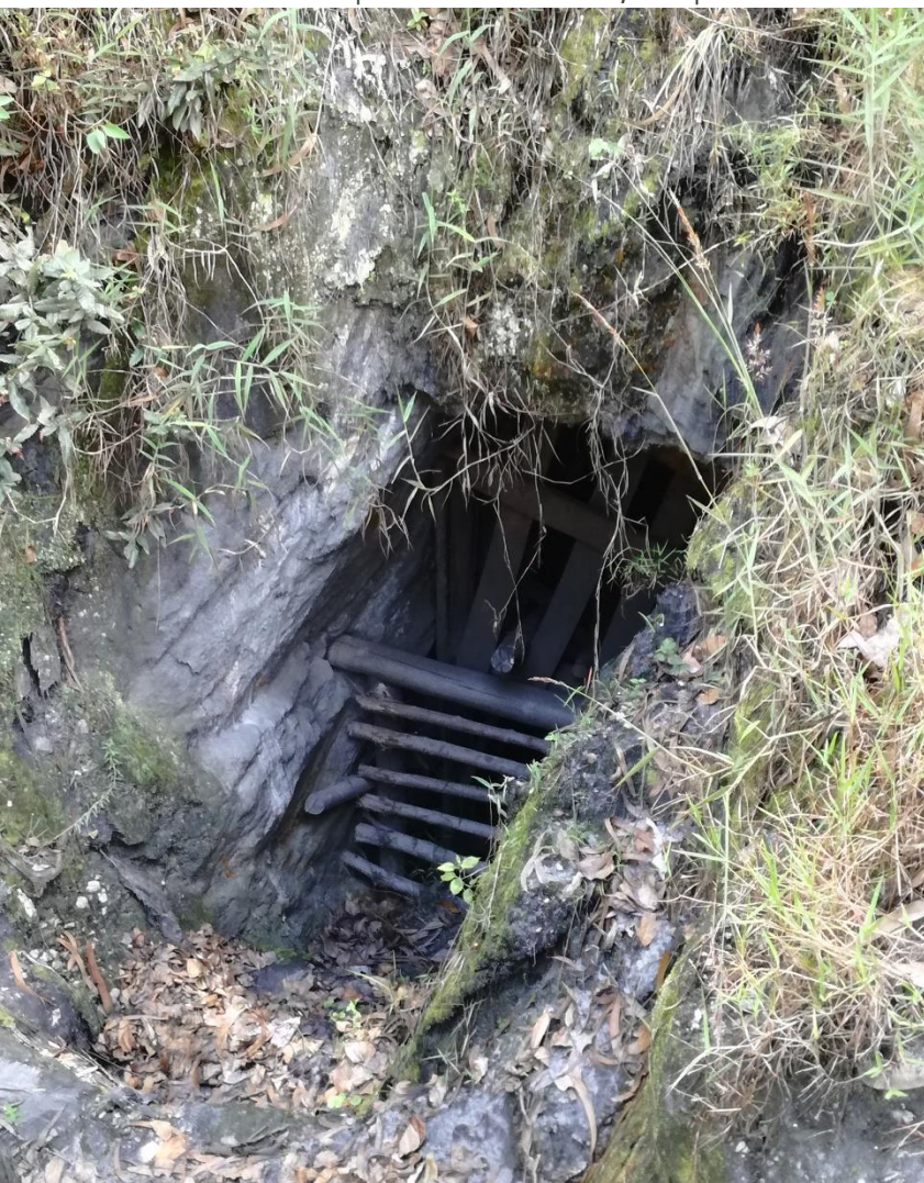
Figure 7: Closed unsafe artisanal tunnel

In summary, the investments in infrastructure, semi-mechanisation, and professionalisation of extraction processes have enabled NBM to become a well organised and more productive mining operation. It is important to underline that in parallel to the development at NBM, the government of Rwanda has also been promoting the integration of modern mining techniques and equipment to improve skills development in the sector. The government's aim is to improve working conditions and attract more investment in the sector. NBM's journey in terms of better mining techniques, equipment and infrastructure can be seen as an example of progress in this enabling environment, as will be further examined.