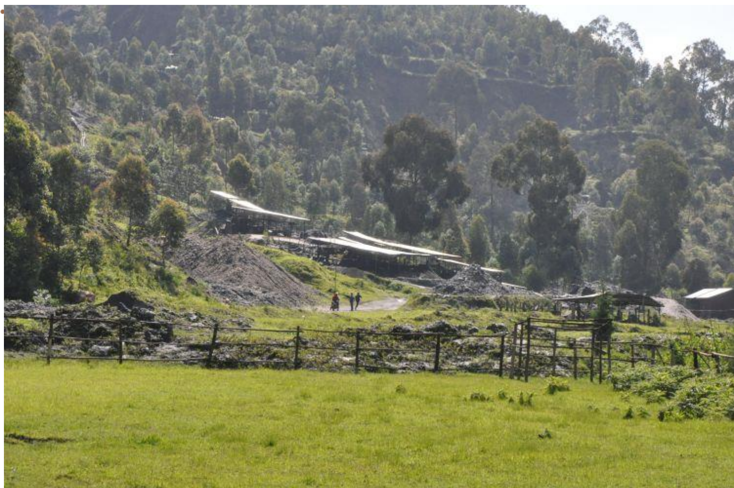
Figure 14: Part of the mine site