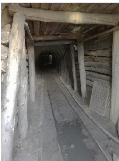
Figure 3: Entrance modern tunnel - 2021

Development of modern tunnels. The modern tunnels developed over the past years have increased the accessibility and safety of underground work. These tunnels are built with timber structures. They have water and compressed air pipes and rails to ease the transportation of the mined material outside of the tunnel.