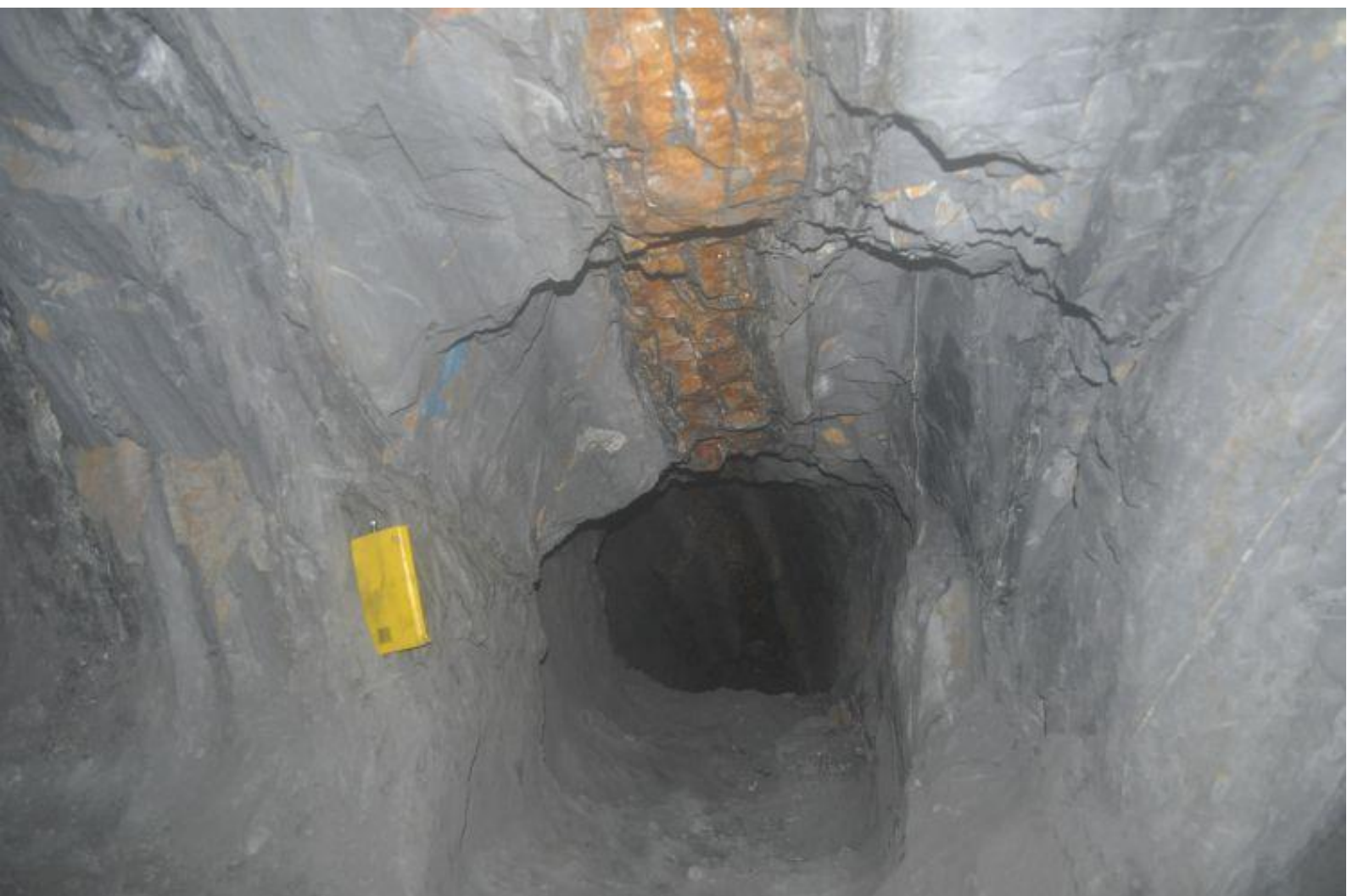
Figure 10: An ore vein

Mining and geology competence. Considering the state in which the mining operations were in 2009, reorganisation, formalisation and progressive improvements would have been difficult without the professional mining engineering and geological expertise brought in by NBM management. Expert local executives and technicians lead operations and have played a pivotal role in the progress made to date.